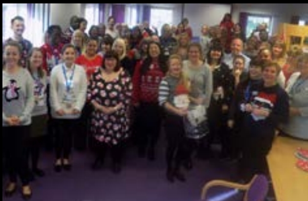
Mid Essex CCG staff on Christmas Jumper Day